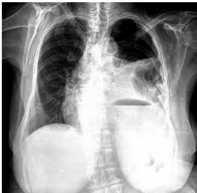
Fig. 1. PA chest X-ray. The left diaphragm cannot be seen. There are heterogeneous opaque areas with a lost view of parenchyma on the left

formed on an emergency basis. In the exploration, it was observed that the abdominal organs had moved into the thorax, the tissue on the left lung had collapsed, a pericardial rupture (PR) of 7 cm had occurred in front and parallel to the left phrenic nerve, and there was a rupture of 6 cm into the pericardium in the transverse position to the diaphragm's position next to the pericardium (Fig. 2). The organs were moved inside the abdomen, and firstly the PDR area, and then the PR area that extended along the phrenic nerve in the pericardium were primarily repaired. During repair, serious arrhythmia was observed due to the retraction of the heart. The patient was discharged without complications and was followed up for two years without any symptoms.