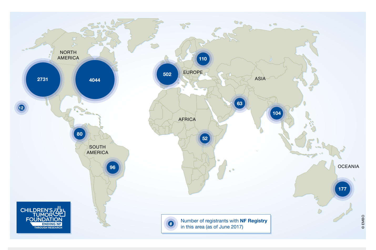
Figure 2. The number of patients that are enrolled in the NF patient registry that represents more than 8,000 patients from 98 countries (as of June 26, 2017).

NF "dream team" initiative called Synodos in 2014 (www.synapse.org/synodosNF2).