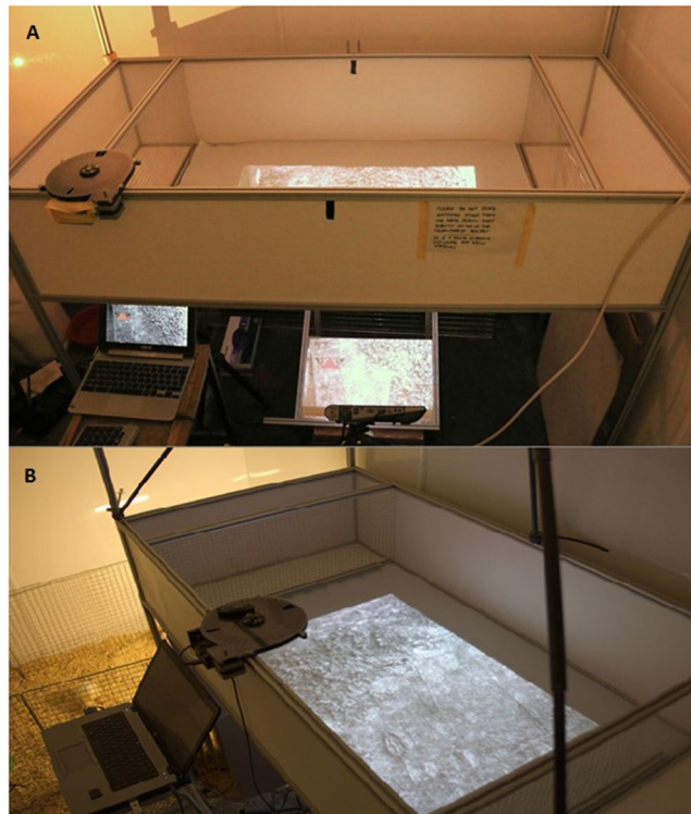
Figure 2. Images of arena showing the projector (A) and the layout of the experimental arena in the centre and buddy areas on either side, each containing two buddy chicks (B).

Background images. Background images were created from 57 monochromatic photographs of tree bark (oak, beech, birch, holly and ash) taken using a Canon 5D MKII with a Nikkor EL 80 mm lens at F/22 to ensure a sizable depth of field. These photographs were taken under diffuse light conditions and the images were uploaded to a computer where they were standardized to ensure they had a similar mean luminance and contrast (variance in luminance). See the supplementary material for image processing methods.