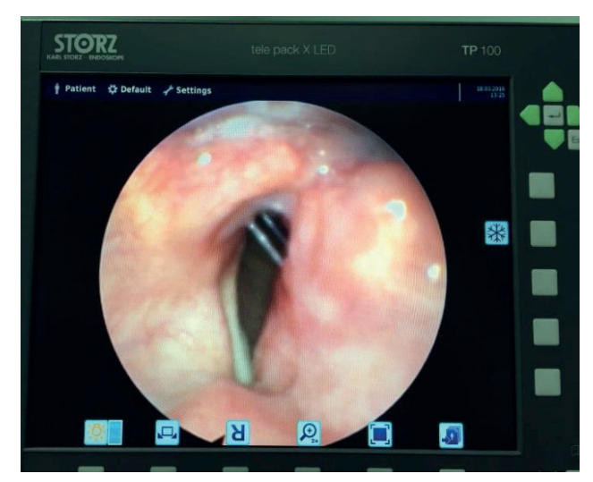
Figure 3. Laryngeal fiberoscopy; left vocal cord paralysis

and chlorine while glucose level increased slightly. Cytological analysis of the CSF revealed lymphoid cell elevation (130/ \mu l). Polymerase chain reaction (PCR) test for BK virus, Adenovirus, EBV, TBC, CMV, HSV1/2, JC virus, Brucella, atypical pneumonia agents in CSF were negative but only VZV-DNA was positive (+2/5 copy). Serum VZV IgG was elevated (749 mIU/ml) (Table 1).