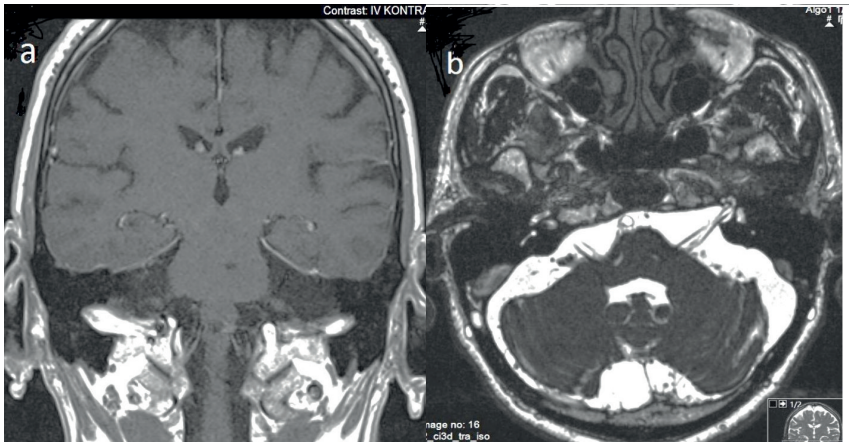
Figure 2. Brain MRI. A contrast-enhanced T1-weighted image (a) and T2-weighted non-contrast image (b) disclosed normal cranial nerves