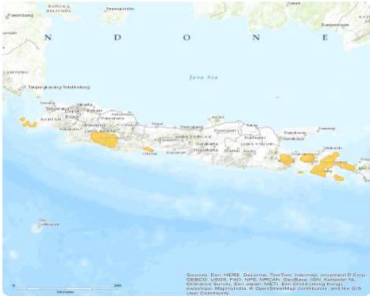
Fig. 2. Range map of Javan rusa ( Rusa timorensis ).

island, the deer are high in forested areas especially on military lands, but lower in the area with more human habitation (probably 0–0.5 km 2 ) (Wiles, 2012). In another area of dense forest at the Andersen Air Force Base (AAFB), especially in the Munitions Storage Area (MSA) that has never been opened for intensive legal hunting, Wiles et al. (1999) estimated a minimum density of 60–80 deer/km 2 in 1990s. Likewise, based on a survey conducted in 2001 at the same area, higher densities of deer (183 deer/km 2 ) was suggested (Vogt, U.S Navy, Hawaii, USA, unpublished data, 2005). Fig. 4 shows the range map of Philippine deer.