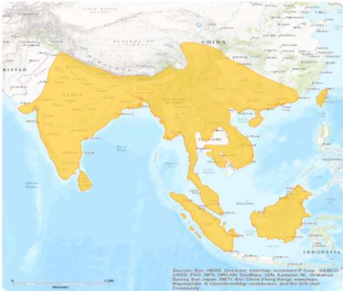
Fig. 1. Range map of Sambar deer ( Rusa unicorn )