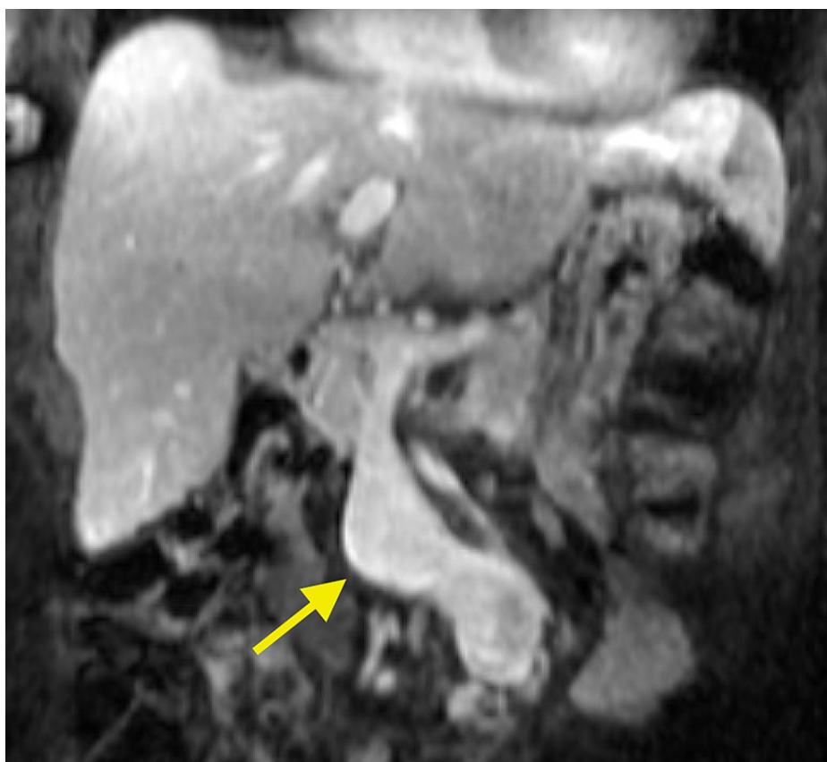
FIGURE 2: Coronal contrast-enhanced T1 weighted MRI depicting the superior mesenteric fistula in profile (yellow arrow).

The following day, the patient went to the angiographic suite. A 4 French micropuncture kit was used to access the right common femoral artery and upsized to a 5 French vascular sheath. Using standard catheter and guidewire technique, a 5 French Omni Flush catheter was advanced to the suprarenal abdominal aorta, and digital subtraction angiography was performed. The aortogram demonstrated normal patency of the celiac and superior mesenteric artery origins. A large, early draining vein, the SMV, was identified arising from the third-order jejunal branches (Figure 3). The SMA was then selected, and repeat DSA confirmed the selection of the SMA and provided a roadmap. The catheter was exchanged for a 6 French destination sheath at the origin of the SMA, through which a 4 French glide catheter was advanced to the distal SMA branch just