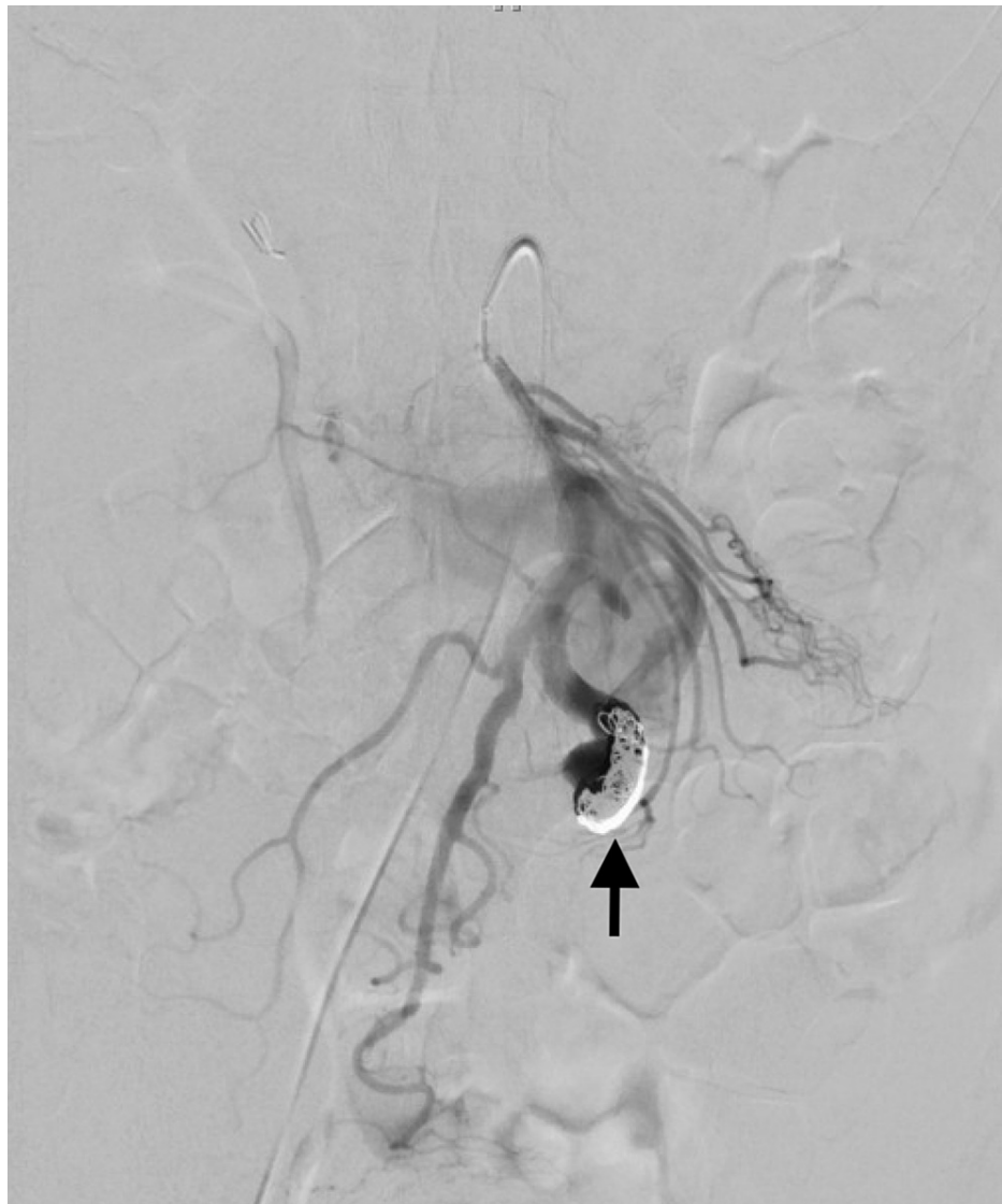
FIGURE 4: Post-embolization arteriogram from the superior mesenteric artery depicts markedly reduced opacification of the superior mesenteric arteriovenous fistula with minimal residual flow. Note the densely packed coils at the arterial inflow (black arrow).

There was complete resolution of symptoms by the time of discharge. A follow-up ultrasound examination in three months demonstrated satisfactory thrombosis of the previously seen SMAVF without any residual flow (Figure 5).