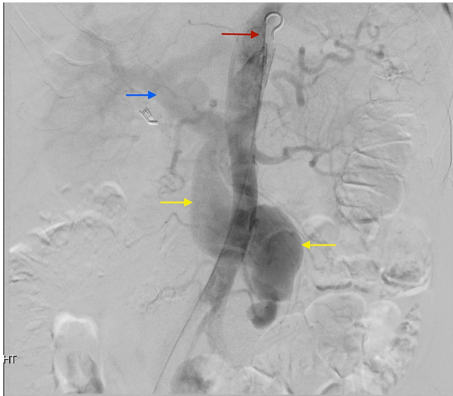
FIGURE 3: Angiography from a flush catheter in the aorta (red arrow) depicts early opacification of a large draining vein, the superior mesenteric vein (yellow arrows). Early filling of the portal vein (blue arrow) is also noted.

proximal to the fistulous connection. Satisfactory positioning was confirmed with DSA angiography. Coils (measuring 20 mm x 20 cm, 6 mm x 20 cm, 4 mm x 7 cm, 5 mm x 11 cm) were sequentially deployed, each time followed by angiographic interrogation. Final post-embolization imaging demonstrated marked decreased flow through the SMAVF (Figure 4). All of the jejunal and ileal branches seen pre-embolization were again noted and found patent. All guidewires and catheters were removed, and hemostasis was achieved with a 6 French Angio-Seal device and manual pressure. There were no immediate or delayed complications.