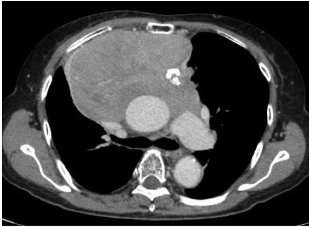
Figure 2. Contrast computed tomography images at the end of proton beam therapy. The tumor was 13 cm in diameter and its volume had decreased to 811 cc.