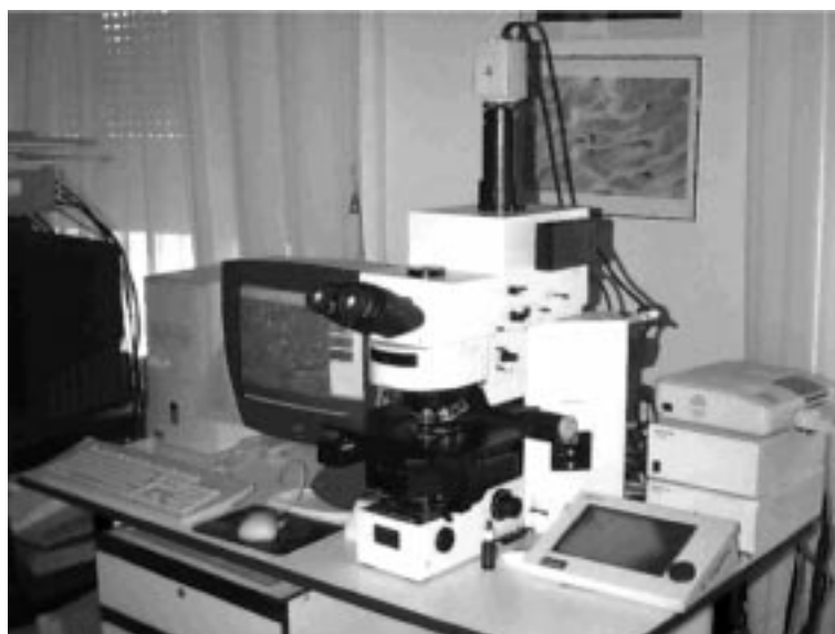
Fig. 1. The complete Migra telepathology system.

The Vision&Live dynamic subsystem (IAT, Switzerland) is based on the H320 videoconference protocol, and uses up to 3 ISDN basic rate lines for transmission of real-time audio and video (equivalent to 384 Kbit/s in the Euro-ISDN standard). It allows for selection of video sources, which are usually two, one linked at the microscope camera, and the other at a desktop camera useful for videoconferencing between local and remote operator, together with an audio connection. The data channel of the system is used for remotely driving the robotic microscope, when available.