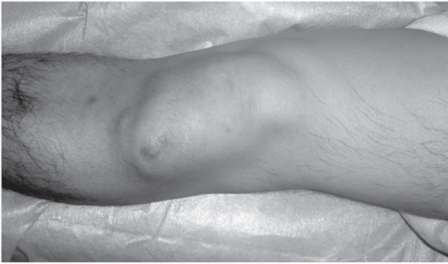
Figure 1. Clinical appearance of the left knee. The tumor was evident, extending from the subcutaneous tissue to the deeper aspect of the knee joint.