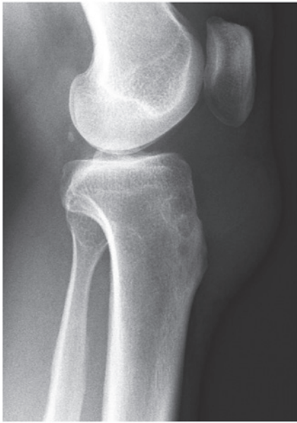
Figure 2. Plain lateral radiograph of the left knee demonstrating erosion of the tibia.