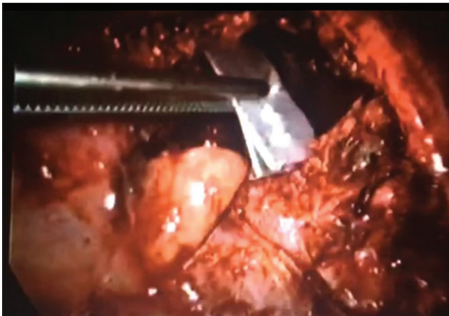
Figure 4: Measurement of the size of the graft postcorpectomy.