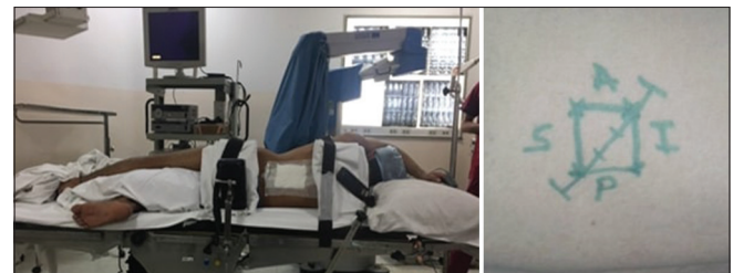
Figure 1: Right lateral decubitus of patient after posterior surgery with left-sided chest upwards and surface marking for single-level corpectomy, S: Superior, I: Inferior, A: Anterior, P: Posterior.