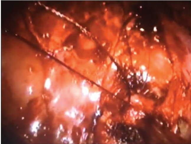
Figure 3: Image showing ligation of segmental arteries.