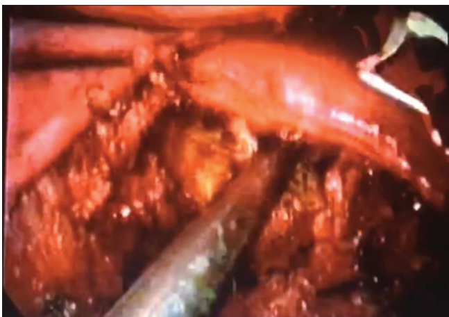
Figure 5: Iliac crest strut graft insertion into the corpectomy site.