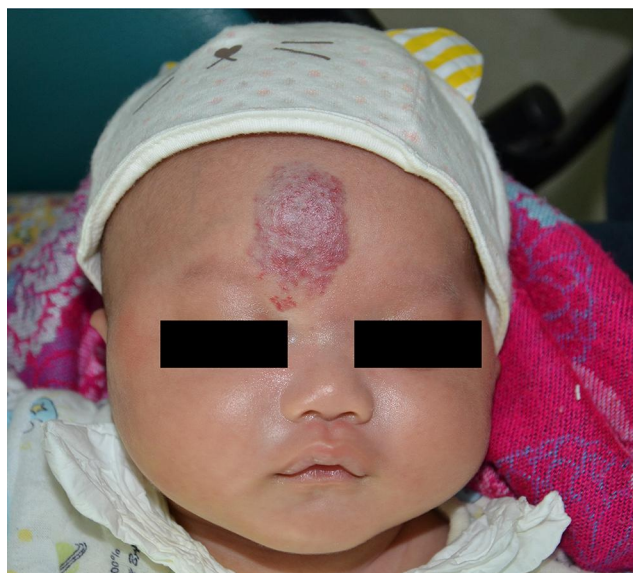
Figure 3 A four-week-old patient with focal IH was treated with oral propranolol.

a stable plateau phase, and 11 patients were in an involuting phase. Seven segmental IHs were located on the extremities. They were superficial and were not associated with serious complications such as ulcers. The other two patients' lesions were located on the right waist and behind the right ear. Their parents refused any treatment. The patients with segmental IHs were more inclined to receive early oral drug interventions than nonsegmental IH patients ( P < 0.001 ). Propranolol at a dose of 2 to 3 mg/kg per day was administered in 105 (68.63%) of 153 segmental IH patients (Table 3).