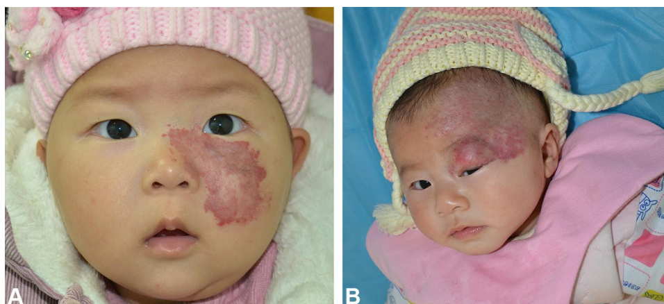
Figure 4 Segmental IH of the face and head: it showed a facial segmental IH with a telangiectatic red macule during involuting stage (A); and a mixed segmental IH with bluish tumor below the red plaque, causing visual field cut. This patient has previously been treated with topical timolol before referral (B).

The characteristic growth curves of most IHs are nonlinear. 1 After a period of 1–3 weeks, an IH begins to proliferate, and the rapid growth period of an IH is often within the first 3 months of life, 5,6 accordingly, the tumors