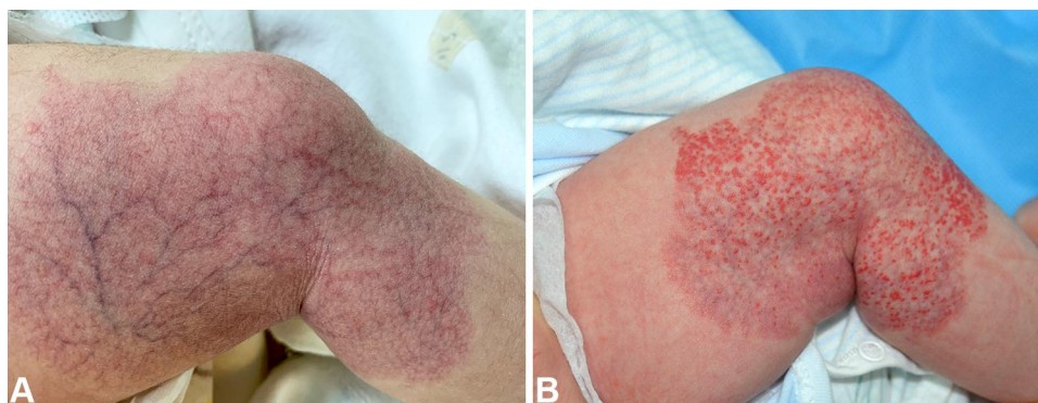
Figure 2 Segmental IH of the right lower limb: It showed a dark red plaque with telangiectasia at birth (A) and a bright red plaque with clustered red papule at the age of 3 weeks (B).