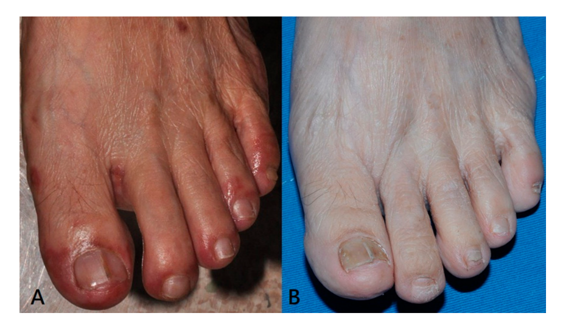
Figure 1. ( A ) In the acute stage, the cutaneous lesions, such as erythematous papules and pustules, around the nail matrix of the first, fourth and fifth toenails of left foot are relatively prominent than on the second and third toe; ( B ) about two months later, onychomadesis on the second and third toe of left foot.