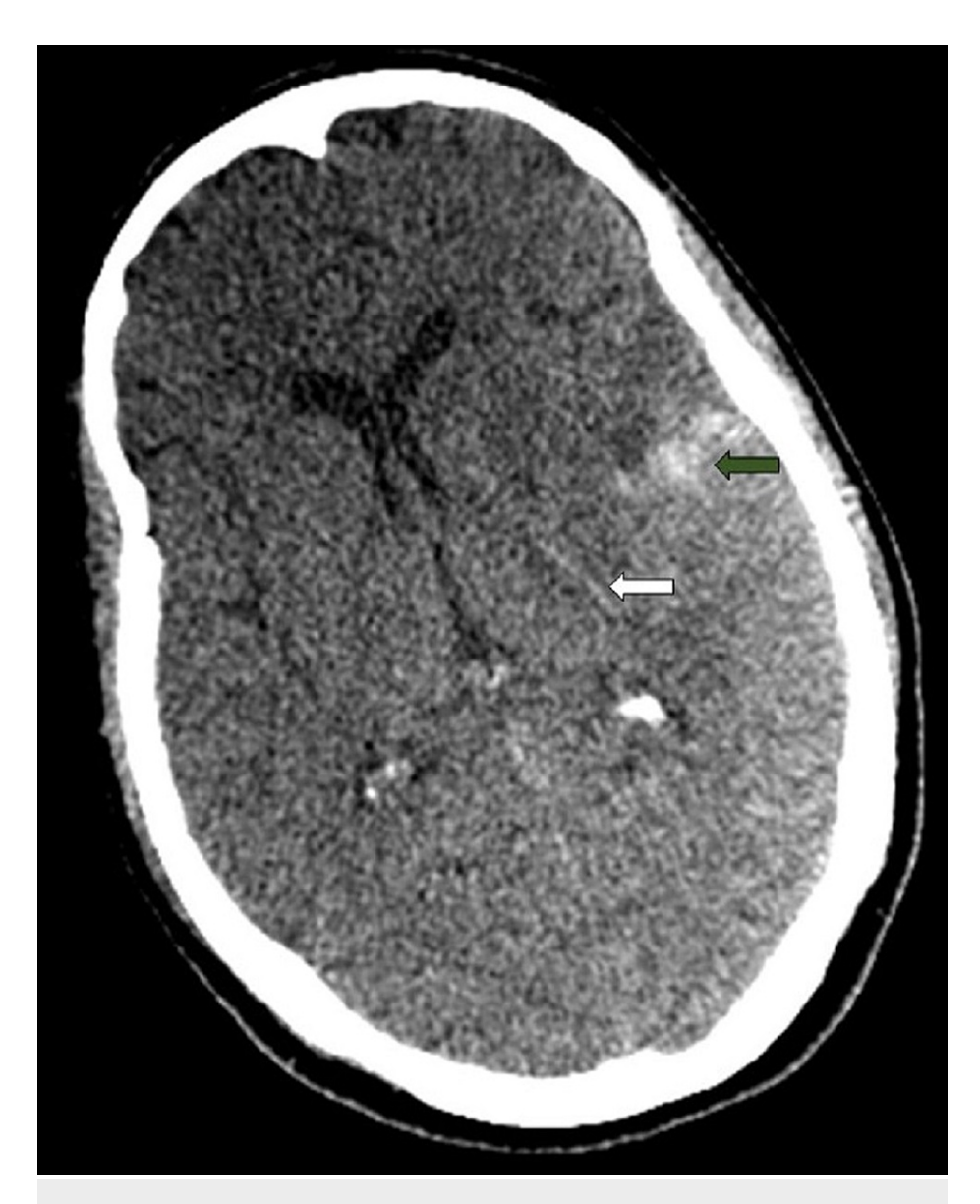
FIGURE 2: Cerebral CT, axial section, without injection of contrast.

Subarachnoid meningeal hemorrhage (white arrow) and intraparenchymal hematoma (green arrow).