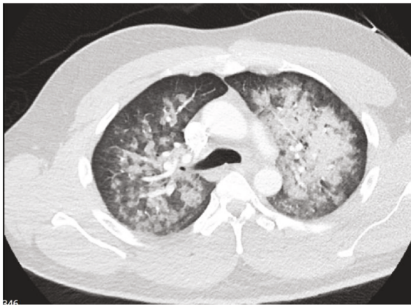
FIGURE 2: Contrast-enhanced computed tomography of the chest on day #2 shows diffuse bilateral airspace disease characterized by groundglass and consolidative opacities, with relative peripheral sparing and perihilar predominance. No pleural effusions or pneumothorax.

7.18 with a p\text{CO}_2 of 51 mmHg. Chest X-ray (CXR) demonstrated diffuse bilateral alveolar infiltrates (Figure 1(a)). Computed tomography (CT) of the chest showed diffuse bilateral airspace disease characterized by groundglass and consolidative opacities with relative peripheral lung sparing and perihilar predominance (Figure 2). He received naloxone with mild improvement in mental status and was initiated on Bilevel Positive Airway Pressure (BiPAP) with an inspiratory positive airway pressure (IPAP) of 15 cm \text{H}_2\text{O} , expiratory positive airway pressure (EPAP) of 5 cm \text{H}_2\text{O} with 40% fraction of inspired oxygen ( \text{FiO}_2 ). Empiric broad spectrum antibiotics including vancomycin, cefepime, and metronidazole were initiated along with intravenous methylprednisolone 40 mg every 12 hours.