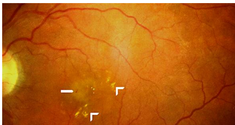
Fig. 1. Color fundus photograph of the LE in an 85-year-old patient with IMT-1 associated with type 3 neovascularization, presenting 2 small hemorrhages nasally to the fovea (arrow), accompanied by lipid exudates (open arrowheads).