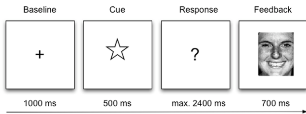
Figure 3. Time line of the gambling task. One of three visual cues (circle, triangle, star) was presented for 500 ms; subsequently, participants had to decide which of two buttons to press considering previously learned cue-response contingencies. After a delay of 400 ms, feedback was presented for 700 ms. Happy faces indicated positive and angry faces indicated negative feedback. doi:10.1371/journal.pone.0050283.g003

The electroencephalogram (EEG) was recorded from 61 Ag/AgCl ring electrodes, arranged equidistantly in an electrode cap (EASYCAP GmbH, Herrsching, Germany; model M10). A balanced sterno-clavicular reference was used [61]. For off-line eye-movement correction, vertical and horizontal electrooculogram (EOG) was recorded bipolarly with electrodes placed on the outer canthi, and 1 cm above and below the left eye. Two pre-experimental eye-movement calibration trials were performed to calculate subject- and channel-specific weighted parameters for correction [62]. Electrode impedances were kept below 2 k \Omega using a skin scratching procedure prior to EEG recording (see [63]). Signals were amplified using an AC amplifier set-up with a time-constant of 10 sec (Ing. Kurt Zickler GmbH, Pfaffstätten, Austria). All signals were recorded within a frequency range of 0.016 to 125 Hz and sampled at 250 Hz for digital storage.