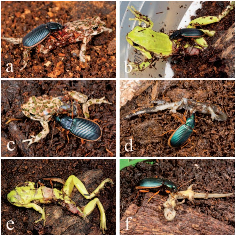
Figure 2. Predation of amphibians by adult Epomis : a B. viridis juvenile by E. circumscriptus b Hyla savignyi juvenile by E. circumscriptus c B. viridis juvenile by E. circumscriptus d S. s. infraimmaculata metamorph by E. dejeani e H. savignyi juvenile by E. circumscriptus f T. vittatus metamorph by E. dejeani (photographs by Gil Wizen).

( n=5 ) completely avoided any encounter with T. vittatus . In two cases of E. circumscriptus the beetle jumped on the newt but did not initiate biting, and within ca. 10 seconds turned away from the amphibian. It then moved its forelegs and antennae through its mouth parts; this display appeared as cleaning behavior. In one case E. circumscriptus clasped T. vittatus by its neck using its mandibles and carried it for a short distance (ca. 10cm). The beetle then dropped the newt on the ground and ceased biting. The beetle was restless, repeatedly moving its forelegs and antennae through its mouth parts as described above.