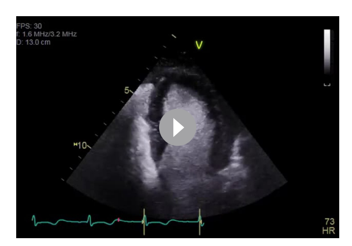
Video 3 Contrast-enhanced focused left ventricular view on apical four chamber transthoracic echocardiography on day 9 demonstrating complete resolution of left ventricular dysfunction and previously evident myocardial akinesis

Noteworthy is the speed of recovery of our patient's myocardial dysfunction, evident with normalisation of cardiac function on both serial echocardiography and on cardiac MRI. Recovery