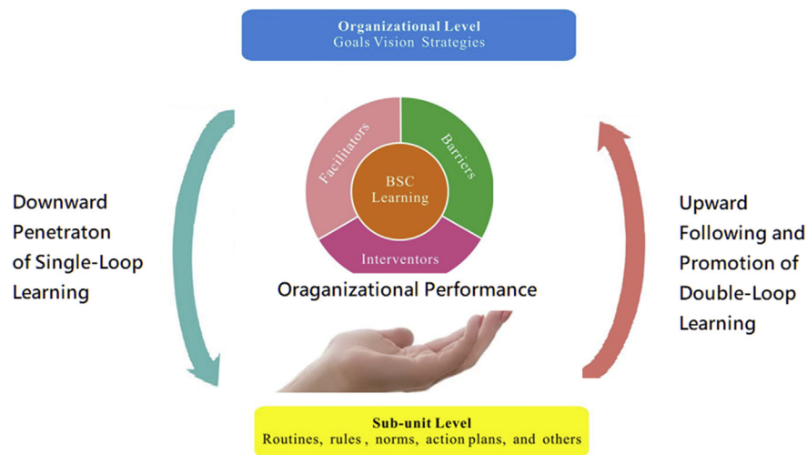
Figure 2. Conceptual Framework (Illustration of this study).

implement required measures to meet their set goals. Table 3 shows the quantitative indicators of performance measurements and the expected learning goals. The top management had set up a policy to review and monitor the results of BSC goals by asking relevant departments to provide an annual report.