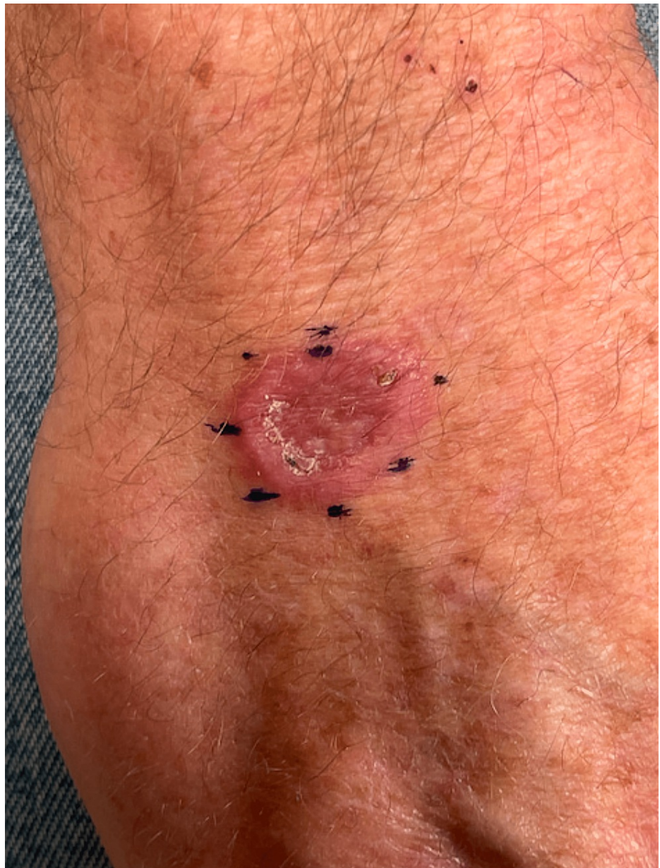
FIGURE 1: Clinical examination of the right dorsal hand

Erythematous plaque measuring 2.1 × 1.6 cm with rolled borders, central scale, and dilated vasculature