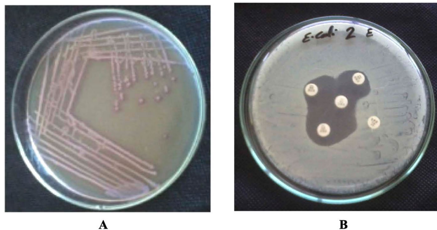
Figure 1. (A) E. coli on chromogenic agar. (B) Detection of ESBL production tested by the Modified Double Disc Synergy Test (MDDST). The test was done by using a disc of amoxicillin-clavulanate (20/10 µg) along with four cephalosporins; cefotaxime, ceftriaxone, cefpodoxime and cefepime.