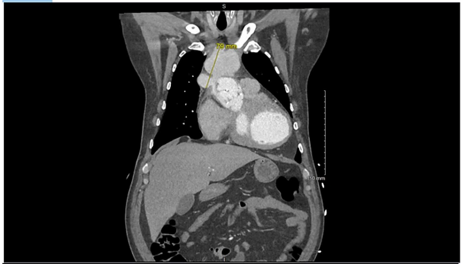
FIGURE 1: Coronal view of CT scan demonstrating the pseudoaneurysm of the aorta; yellow line demarcates the pseudoaneurysm with exact dimensions.