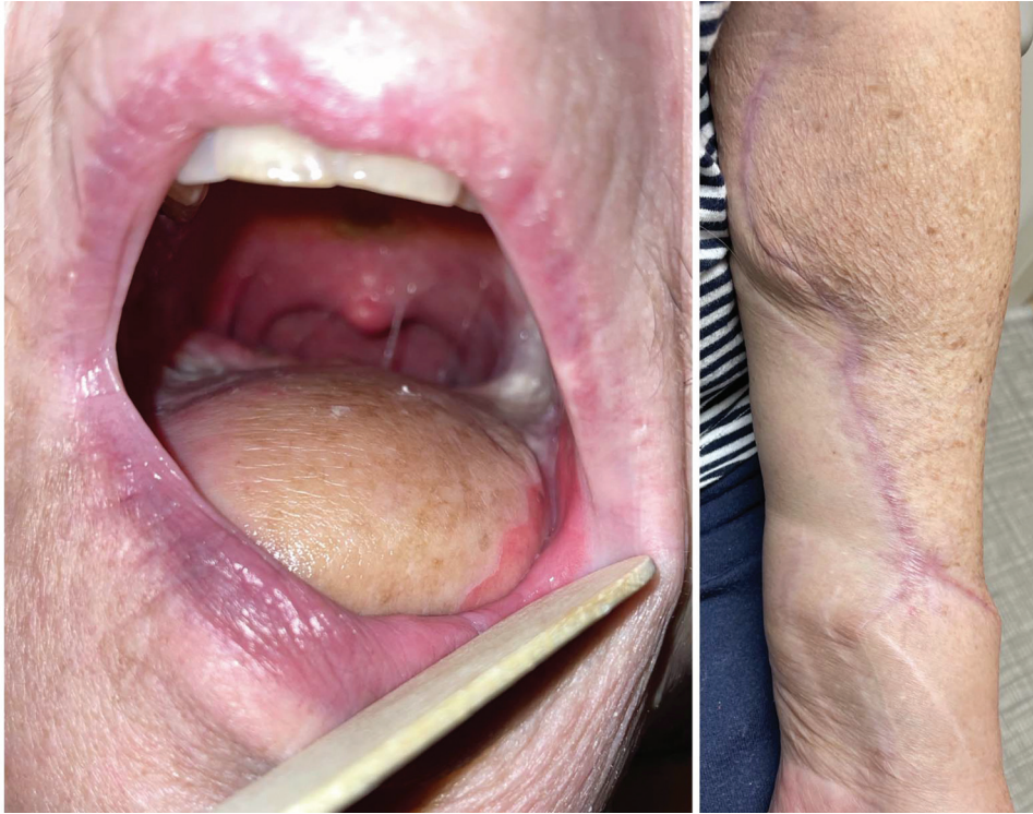
Fig. 4. Six-month postoperative photo demonstrating favorable healing of the RFFF in 4A within the oral cavity and of the forearm donor site which was able to be closed primarily in 4B.

unlikely since the Allen's test confirmed adequate blood flow prior to the operation from each of these vessels when the other was occluded.