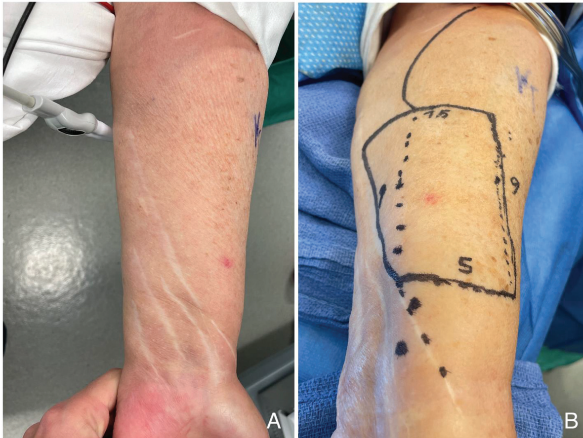
Fig. 1. The patient's left forearm and scars due to previous self-inflicted wrist laceration are shown in 1A; similar scarring was seen on the right dominant arm. Preoperative planning of RFFF design including planned dimensions of flap and course of radial artery proximally are shown in 1B.