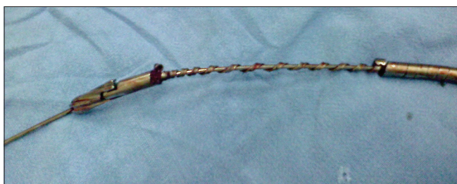
Figure 3: Photograph showing uncoiled reamer

track in the medullary canal is 1-mm wider than the intramedullary nail that the surgeon proposes to use. If reaming is difficult, than the surgeon may choose to ream only 0.5 mm more than the nail, but this is hazardous as the nail may get stuck and be impossible to remove, moreover the reamer may uncoil.