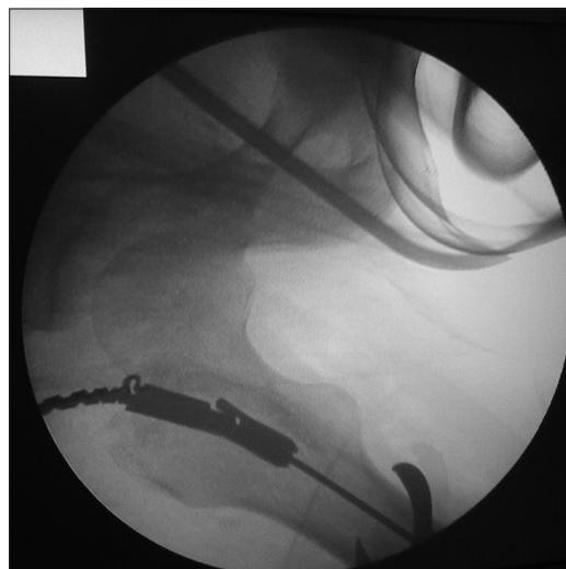
Figure 2: Intraoperative anteroposterior view of the right femur taken with image intensifier showing uncoiled reamer