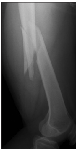
Figure 1: Radiograph of right femur showing fracture shaft femur