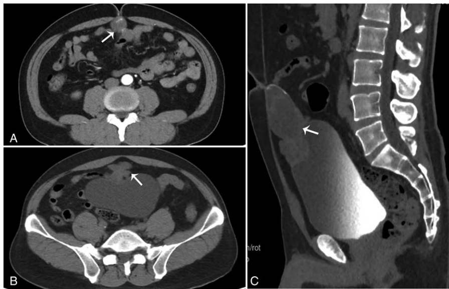
Figure 1. Abdominal plain CT scan revealed a hypo-dense mass with calcification (A) and lobulated shape (B) in enterocoelea extending from umbilicus to anterosuperior dome of bladder (C). CT=computed tomography.

hypo-density lesion showed no obvious enhancement in contrast-enhanced CT scan, but nonetheless, we also clearly observed asymmetrical septa and dense shadow at the margin of cystic wall, which showed mild enhancement in delayed phase (Fig. 2). There were no image features of metastatic lymph nodes or other sites. Radiologically, a diagnosis of urachal cystadenoma with unknown malignant potential was put forth.