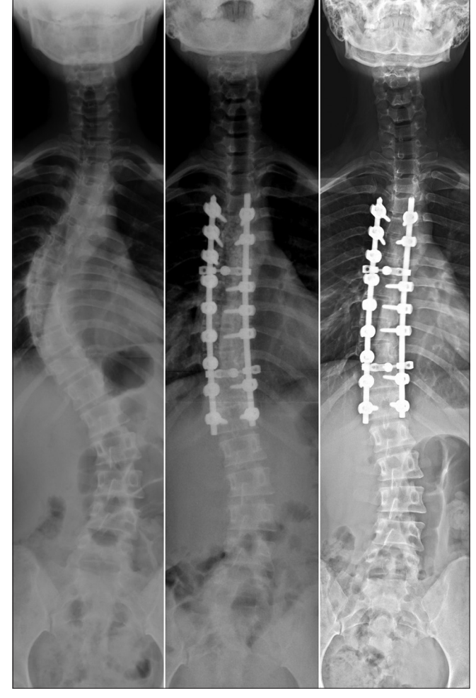
Figure 2: Preoperative, postoperative and followup anteroposterior view radiographs of a 16-year-old patient from the convex group, showing equally effective outcomes as that of concave group

The study sample consisted of 88 patients with a mean age of 14.1 \pm 2.2 (10 - 20) years. There were 10 male and 78 female patients in the selected sample. Their average Risser's score was 2.9 \pm 1.8 . Division of our selected sample according to the derotation maneuver used intraoperatively, ensued 2 comparable groups that were