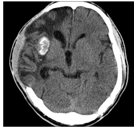
Fig. 4. After navigation-guided drainage of the abscess, CT scan performed 5 months after admission show calcified brain abscess.