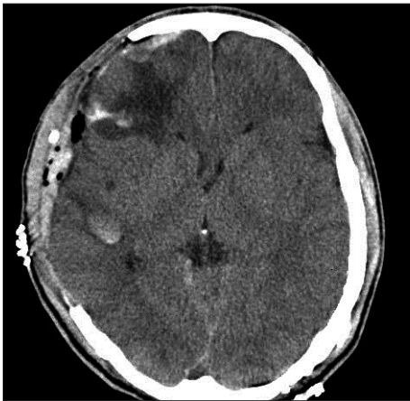
Fig. 1. Postoperative computed tomography scan shows successful removal of subdural hematoma after decompressive craniectomy.