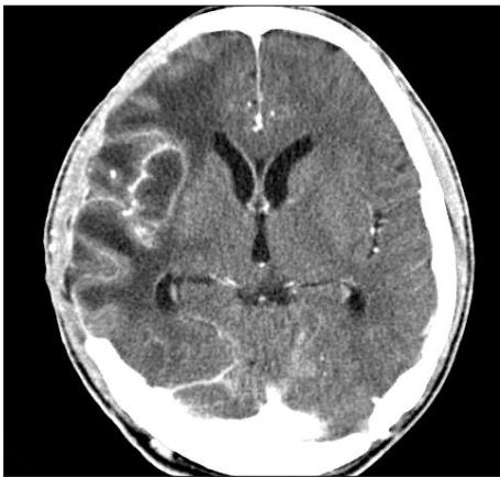
Fig. 2. Contrast enhanced CT scan taken 3 weeks later reveals appearance of an intracerebral abscess with a thin walled cavity.

culture test, and after 6 weeks on antibiotics, he achieved complete clinical recovery except for mild hemiparesis. However, follow-up CT performed 5 months after admission revealed that the brain abscess had developed into a large calcified mass (Fig. 4). Because of its deep-seated location and a lack of clinical symptoms, surgical removal was not performed. Instead, a series of CT scans were taken 3 monthly. No change in either the size or extent of the calcified region was observed over 2 year of follow-up. The patient remains symptom free with mild hemiparesis (Fig. 5).