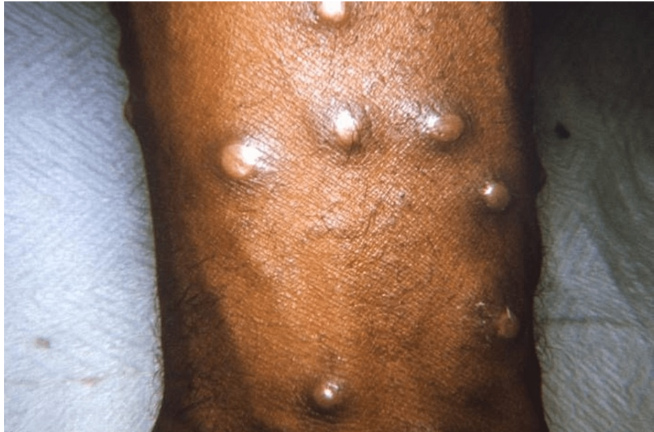
FIGURE 2: Maculopapular Lesions on Arm

Open access journal under a CC-BY license