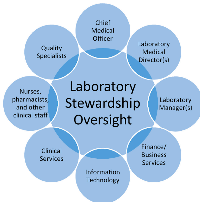
Fig. 1. Possible structure for a laboratory stewardship oversight committee. Regardless of the oversight structure established in a particular health system, participants in laboratory stewardship oversight should include stakeholders from the laboratory, clinic, and health system administration.

Successful programs have a specific point of accountability (eg, a designated leader or two co-leaders). There must also be a