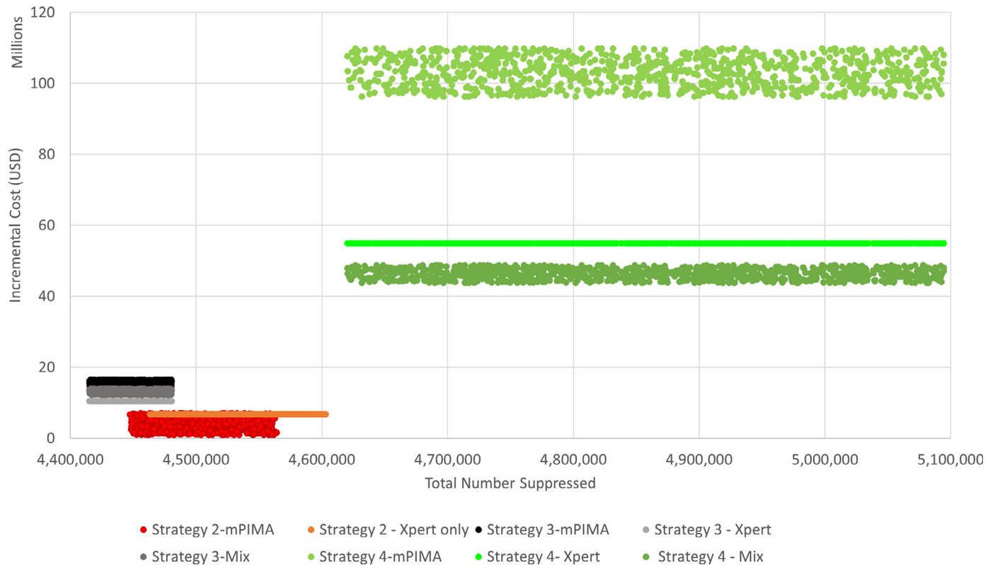
Fig. 2. Probabilistic Sensitivity Analysis – Cost-effectiveness scatter plot. Strategies with m-PIMA technology drives variation in incremental costs in simulation output. Variation in the effectiveness (number of persons suppressed) is greater for the full POC strategy (strategy 4) versus the partial POC strategies (strategy 2).

suppression, and ability to target viremic patients. However, the order of the cost-effectiveness of the POC adoption strategies for strategy 2 changed – the m-PIMA sub-strategy was less costly for a given level of viral suppression (Fig. 2). All other strategies were dominated in the incremental analysis.