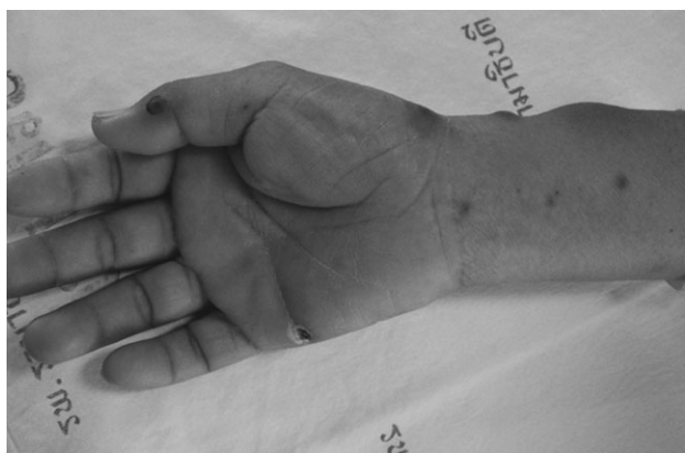
Fig. 1. Multiple lesions of septic embolism on the right arm and old wound from fish bone on the ridge of the hand.

susceptible to the second and third generation of cephalosporins, gentamicin, trimethoprim–sulfamethoxazole and fluoroquinolones. The antibiotics were switched to ceftriaxone after the results of the blood culture. Although fever rapidly subsided within 3 days, the WBC and CPK continued to rise. Meanwhile, she developed pustular skin lesions compatible with septic embolism over all extremities (Figure 1). On the sixth day of admission, ciprofloxacin was added. Cultures from the skin lesion also recovered A. hydrophila . WBC peaked at 43 300 cells/mm 3 on the 7th day of admission and returned to a normal value on the 15th day. CPK peaked at 13 317 U/L on the fourth day of admission and returned to a normal value on the ninth day (Figure 2). She needed more frequent haemodialysis than her previous schedule during the first few days because of severe hyperkalaemia caused by rhabdomyolysis. No further skin lesion developed after the 11th day of admission. She was discharged on the 19th day of admission. The clinical course is shown in Figure 2.