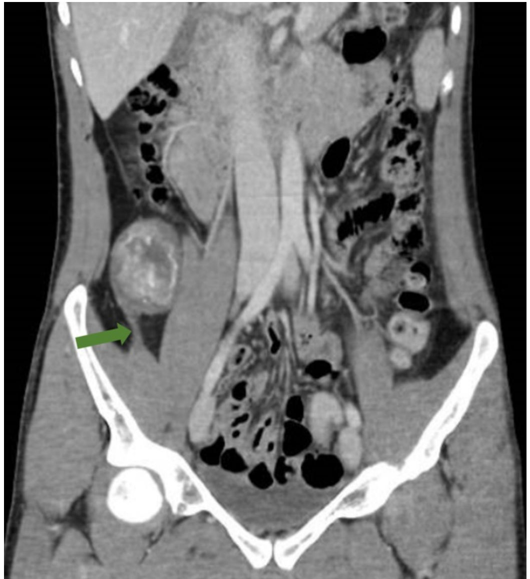
FIGURE 2: Computed tomography of the abdomen and pelvis in portal venous phase (coronal reconstruction).

The inferior tail of the lesion (green arrow) is visible on this reconstruction.