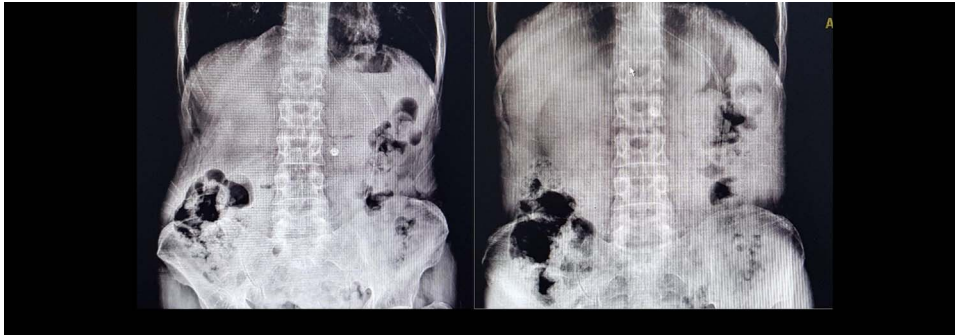
Figure 1: Supine and upright abdominal X-ray.