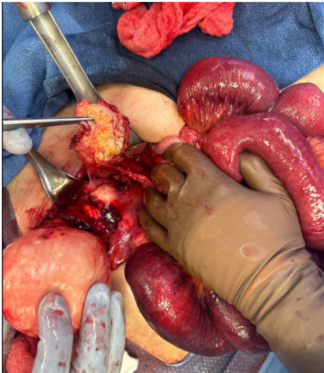
Figure 3 Right pelvic sidewall mass being excised.

with an open approach as the bulk and shape of the fibroid uterus limited pelvic domain, resulting in a limited xyphoid-to-umbilicus distance, and restricted any lateral uterine movement that would facilitate a laparoscopic hysterectomy.