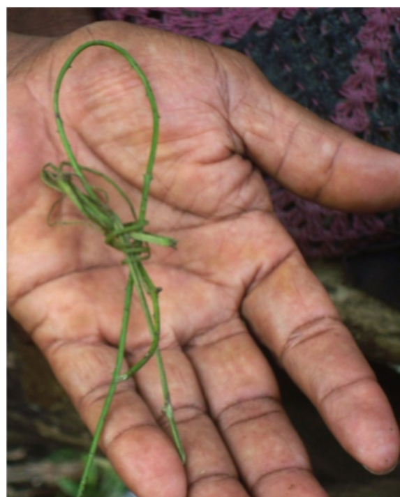
Figure 5 Vine used in penile bloodletting practice.