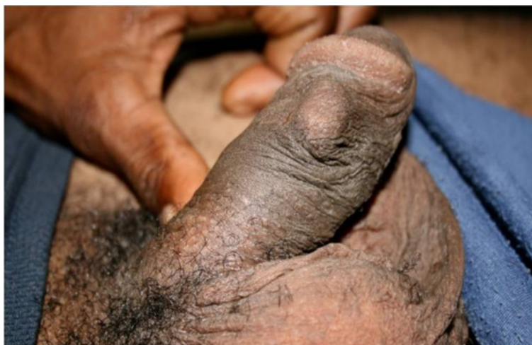
Figure 4 Penile insert: ball bearing in skin of penile shaft.

Malaysian. Those men who had penile inserts said that they had learned of this practice from friends (Asian and Papua New Guinean), from ex-prisoners or whilst in prison themselves.