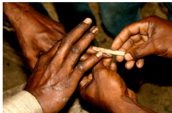
Figure 3 Photograph of male participants showing how a longitudinal cut is performed.

Following cutting, a variety of traditional and/or modern remedies are used to control bleeding, reduce pain and to