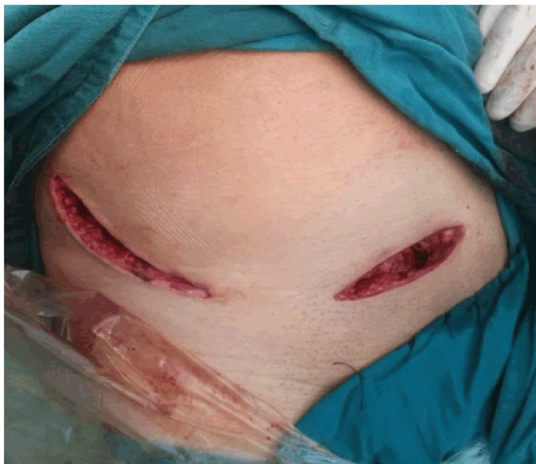
Fig. 2 Surgical incision of the S+IF approach

All fractures were fixed via the IL approach (44 cases) or the S+IF approach (32 cases). There were 47 (62%)