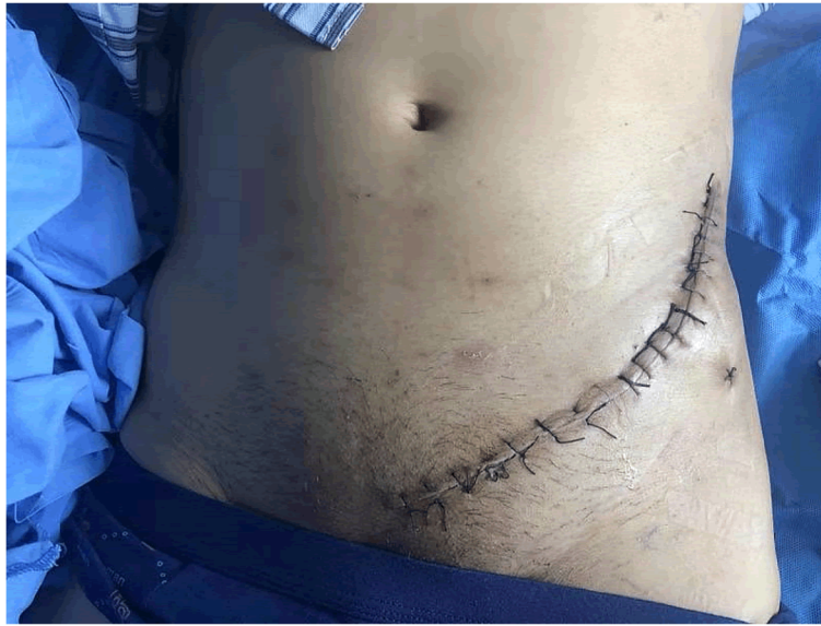
Fig. 1 Surgical incision of the IL approach

Follow-up was performed at 1, 2, and 3 months and 1 year after surgery and yearly thereafter. Clinical outcomes were measured using the Matta modification of the Merle D'Aubigne score [7, 19]. Complications such as infection, neurovascular injuries, and hematoma were also recorded.