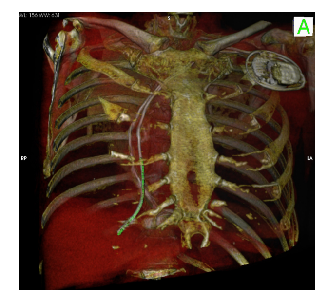
Figure 1 Computed tomographic 3-dimensional reconstruction scan showing the atrial lead migration into the right pleural cavity. LA = left anterior; RP = right posterior.

Cardiac perforation by pacemaker leads is a rare complication, with an incidence of 0.3%-1%.<sup>1,4</sup> Perforations of the right atrium and ventricle are more common than that of the superior vena cava.<sup>5</sup> These perforations frequently occur at the time of pacemaker implantation or during the first days after procedure.<sup>1,6,7</sup> However, cases of delayed lead perforations have also been described in the literature.<sup>8,9</sup> Risk factors for lead perforation are older age, female sex, body mass index of <20 kg/m<sup>2</sup>, active lead fixation, implantable cardioverter-defibrillator, use of corticosteroids within 7 days, and an inexperienced operator.<sup>10</sup> The clinical characteristics of cardiac perforation after pacemaker implantation vary significantly.<sup>5</sup> In most cases of acute perforations,