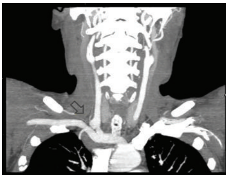
FIGURE 2: CTA shows a 10 mm pseudoaneurysm in the right common carotid artery (black arrow).

9 × 38 mm, Atrium Medical, USA) in the right common carotid artery. Control angiography showed total exclusion of the pseudoaneurysm (Figure 4). No complications occurred during the procedure. The patient was discharged from the hospital with dual antiplatelet therapy 40 days later without any neurological dysfunction or complication related with the intervention. We want to state that the patient provided informed consent for her information and images to be included in this paper and hospital IdiPAZ Clinical Research Ethics Committee provided authorization to submit this case report.