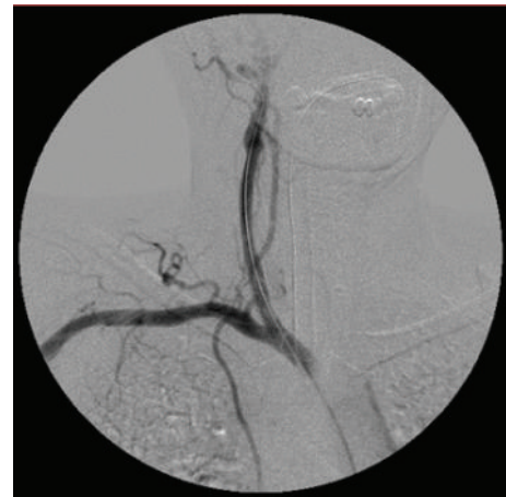
FIGURE 4: Control angiography showed total exclusion of the pseudoaneurysm. A covered stent was implanted in the right common carotid artery.

40% and permanent neurologic impairment in 40% to 80% [8, 9]. Penetrating injuries are associated with a mortality rate ranging from 6.6% to 33% [10].