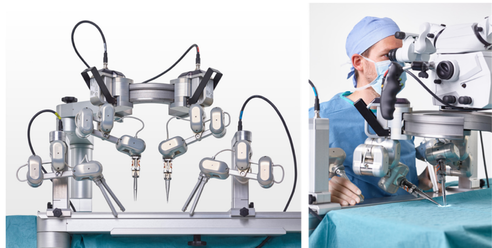
Figure 2. Robotic microsurgery system MUSA from MicroSure (printed with the permission of MicroSure).

This can be considered the beginning of RAS in microsurgery. Already this initial approach showed the limitations of existing systems, given by the insufficient optical magnification and instrument size. Therefore, robotic platforms customized for the needs of microsurgery were created. These systems have multifaceted goals: (a) to effectively filter tremors, (b) to downscale movements beyond the da Vinci's capacities, (c) to provide sufficient magnification, and (d) to be easy to integrate into the OR settings for microsurgical procedures. The Microsurgical Robot (MSR), the MUSA (MicroSure, Eindhoven, Netherlands—Figure 2), and the Symani System (MMI, Pisa, Italy—Figure 3) were developed to meet the aforementioned criteria. These systems are currently in a phase of clinical evaluation and potentially impact the field of microsurgery.