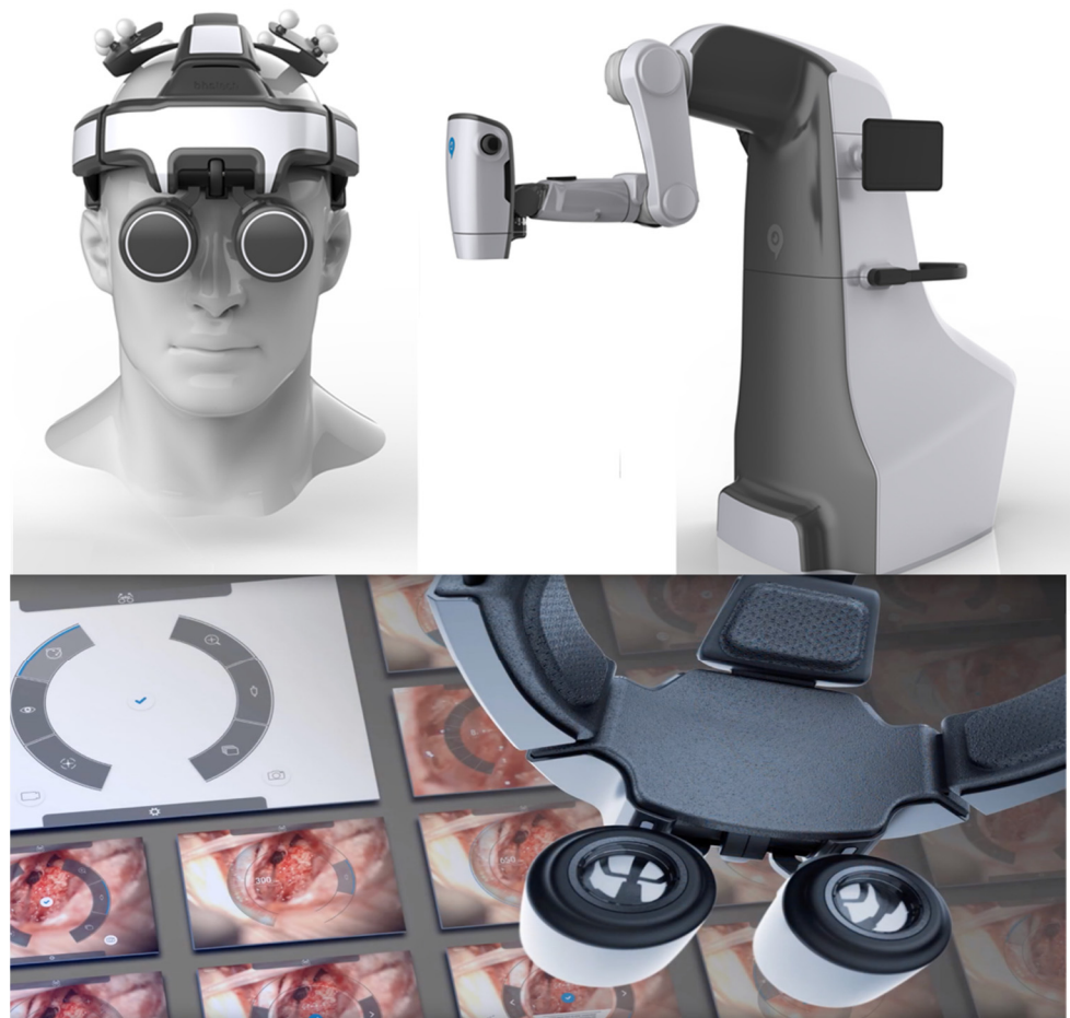
Figure 4. Robotic microscope system RoboticScope from BHS Technologies (printed with the permission of BHS Technologies).