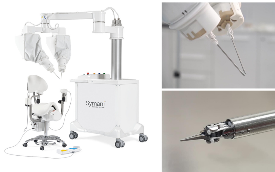
Figure 3. Robotic microsurgery system Symani from MMI.