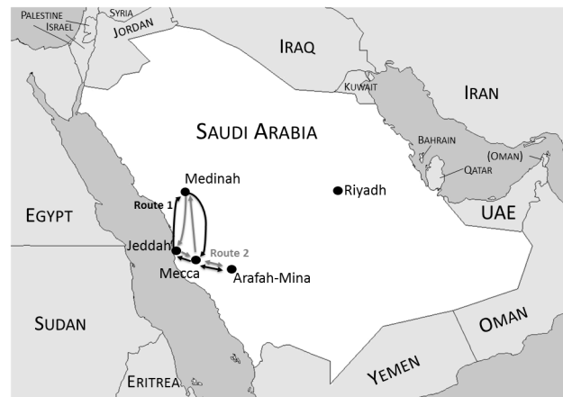
Figure 1. Routes of travel for Indonesian pilgrims, arrival in and departure from Jeddah.

^ Disaggregated data not available. Total for the three groups = 28,200,000.