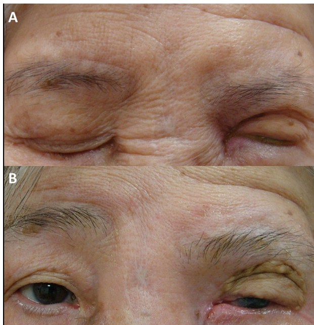
Figure 3 Surgical outcome.

One month after surgery, ocular symptoms completely resolved and the flaps and grafts were viable with no evidence of necrosis. Partial forehead sensation remained intact and there was preservation of muscle tone. Patient had acceptable eyelid closure (Figure 3A) and regained 3–4 mm eyelid opening (Figure 3B). Two months later, she developed tumor metastasis to the ipsilateral parotid gland lymph nodes and subsequently received adjuvant chemotherapy and local radiation therapy. Another month later, her left eye showed regressed corneal neovascularization, uninflamed conjunctiva, moderate tear meniscus, and improved visual acuity from hand motion to 20/400. No postoperative complications such as lid retraction, corneal erosion, or ulceration were observed. For a total follow-up period of 34 months, she remained symptom free without eyelid tumor recurrence and achieved acceptable cosmetic outcome.