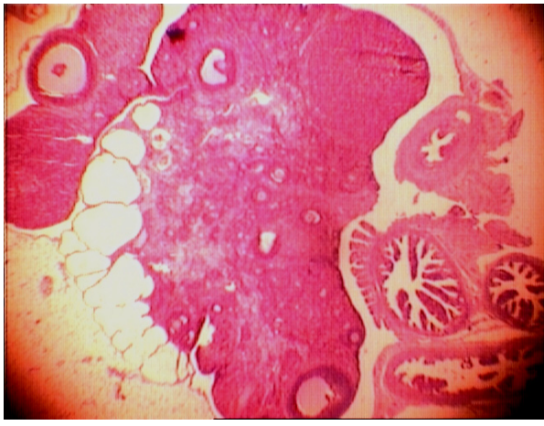
Figure 1. The ovary. In the ovarian tissue, the cysts were mainly appeared by a single intramuscular dose of estradiol valerate, 2 mg in 0.2 ml of corn oil

Hormonal Treatment and Study Procedures: After one week of acclimatization, 8-week-old rats (n = 30) were divided into two groups of control and PCO rats. The control group received 0.2 ml corn oil and all the rates assigned to the PCO group received an i.m. injection of 0.2 mg Estradiol