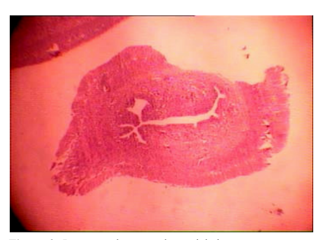
Figure 3. In uterus, better endometrial tissue arrangements were also observed upon Chamomile administration

ovaries and uteri of PCO-induced rats (Figure 1). Rats with PCOS which had been treated by 50 mg/kg of Chamomile extract showed recovery demonstrated by macroscopic and microscopic morphological examination in the ovarian and uterine tissues. In the ovarian tissue, the cysts had mainly disappeared (Figure 2) and the number of dominant follicles had increased (Figure 3) and better endometrial tissue arrangements were observable (Figure 4). Mean hormonal changes in PCO-induced animals, injected with 50 mg/kg of Chamomile extract, showed statistically significant differences in comparison with the controls (p < 0.05), (Table 1). Serum levels of estradiol and gonadotropins, LH and FSH, were significantly decreased in the Chamomile group relevant to the control group (p < 0.05).