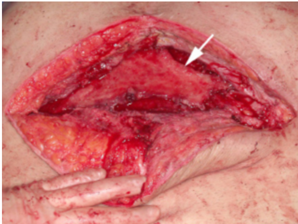
Figure 2B. Intraoperative photograph after mesh removal and drainage of the infected seroma reveals the posterior wall of the seroma consisting of thick granulation tissue (arrow).

The technique of laparoscopic ventral hernia repair leaves a potential space between the mesh and overlying skin that can easily fill with fluid. Studies have demonstrated seromas anterior to the mesh in up to 100% [4, 9-10]. Seroma formation deep to a mesh prosthesis after LVHR is very uncommon, reported by Heniford et al as occurring in 3/819 patients (0.36%) [4]. The vast majority of seromas resolve by 8 weeks postoperatively, with only 2.6% of patients experiencing a persistent seroma [4]. While the majority of seromas do not require any intervention, some require aspiration if they become painful or infected. Infected mesh often needs to be operatively removed, thus resulting in increased morbidity for the patient [11]. Successful nonoperative management of infected mesh has been reported [12].