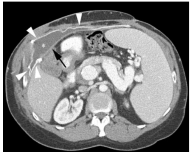
Figure 3. Companion case. Enhanced axial CT through the upper abdomen in a different patient with a seroma (*) deep to hernia repair mesh (arrowheads) and an enhancing wall of granulation tissue (arrow) between the seroma and abdominal cavity. Additional findings of splenomegaly with prominent varices and portosystemic shunts in the splenic hilum and peripancreatic region are sequelae of portal venous hypertension prior to hepatic transplantation.

To our knowledge, no previous radiologic description of a seroma forming deep to a ventral hernia mesh prosthesis has been illustrated in the literature. The imaging appearance on CT is relatively straightforward, being that of a fluid density collection located deep to prosthetic mesh. The only potentially confusing characteristic is that the relatively dense mesh (seen along the superficial border of the seroma in both cases) can, in some areas, appear to