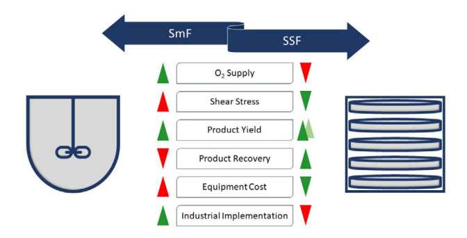
FIGURE 3 Comparison of SmF and SSF concerning the oxygen supply, shear stress, product yield, product recovery, equipment cost and the industrial implementation [94]. Green implies a positive characteristic and red indicates negative characteristics for common aerobic cultivations of microorganisms. SmF, submerged fermentation; SSF, solid-state fermentation.

The used substrates can be natural such as cellulose or agricultural by-products, but due to the construction of the substrate, the basis will be degraded and changes its physicochemical and mechanical properties during cultivation [97]. Raw plant material and waste products are an environmental-friendly and ecological substrate for SSF [17, 20, 99–101]. Furthermore, simple equipment and lowcost educts make SSF a cost-effective alternative [20]. For an easier product recovery and with the possibility of mass balancing and better process control, inert chemically defined substrates show a different approach. Here, different abiotic materials are saturated with media components. During cultivation, the base material and its mechanical properties stay the same [97].