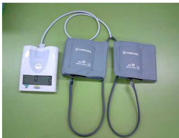
Figure 1 Our custom-made RIC device, showing the body of the system (left) and 2 blood-pressure cuffs connected to the system (right).

TTDE examination was performed using Vivid 7 (GE Healthcare UK Ltd, Little Chalfont, UK) in the standard manner. 19 LV end-diastolic and systolic volumes were obtained using the Simpson’s method and indexed by body surface area. LVEF was then calculated. Pulsed-wave Doppler examination of mitral inflow was performed to measure peak