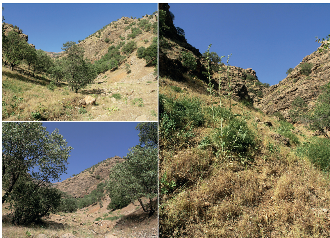
Fig. 3. The habitat of wild peas in Ostan-e Lorestan, Shakhrestan-e Khorramabad, Bakhsh-e Papi, 6.7 km NW of Istgah-e Bisheh village.

abad, Bakhsh-e Papi, 6.7 km NW of Istgah-e Bisheh village (broadly known as simply Bisheh), 33°22'12" N, 48°49'34" E, 1971 m a.s.l. (this is 85 km NW of the previous locality), in a rocky dell with a stony/detritous bottom with rock outcrops, its upper part becomes a small gorge between large cliffs (Fig. 3). The vegetation was dry Persian Oak stand; annual Poaceae, already withered, predominated in the grass layer. Wild pea plants occurred on the detritous bottom and at the base of the rocky right slope of the dell, in a stripe ca 110 m long but not more than 10 m wide; they alternate with plants