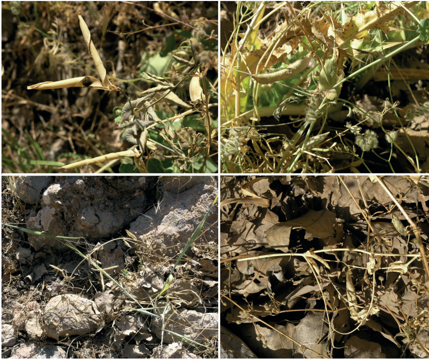
Fig. 4. Plants of P. sativum subsp. elatius of the population at Istgah-e Bisheh village.