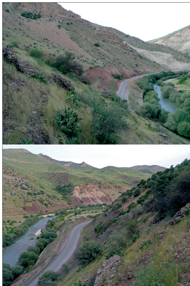
Fig. 1. The habitat of wild peas in Iran, Ostan-e Lorestan, Shakhrestan-e Aligudarz, Bakhsh-e Besharat, at Kagelestan-e Bar Aftab village.

A wild pea population was found on May 23, 2017 in Iran, Ostan-e [Province of] Lorestan, Shakhrestan-e [County of] Aligudarz, Bakhsh-e [District of] Besharat, 700 m N of the centre of Kagelestan-e Bar Aftab village, at 33°02'13" N,