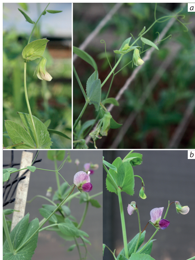
Fig. 7. Flowers of pea accession CE10 in the ICG hydroponic greenhouse (a) and in a mesh house at Agronomy Faculty of Hebrew University of Jerusalem, Rehovot, 07.05.2019 (b).