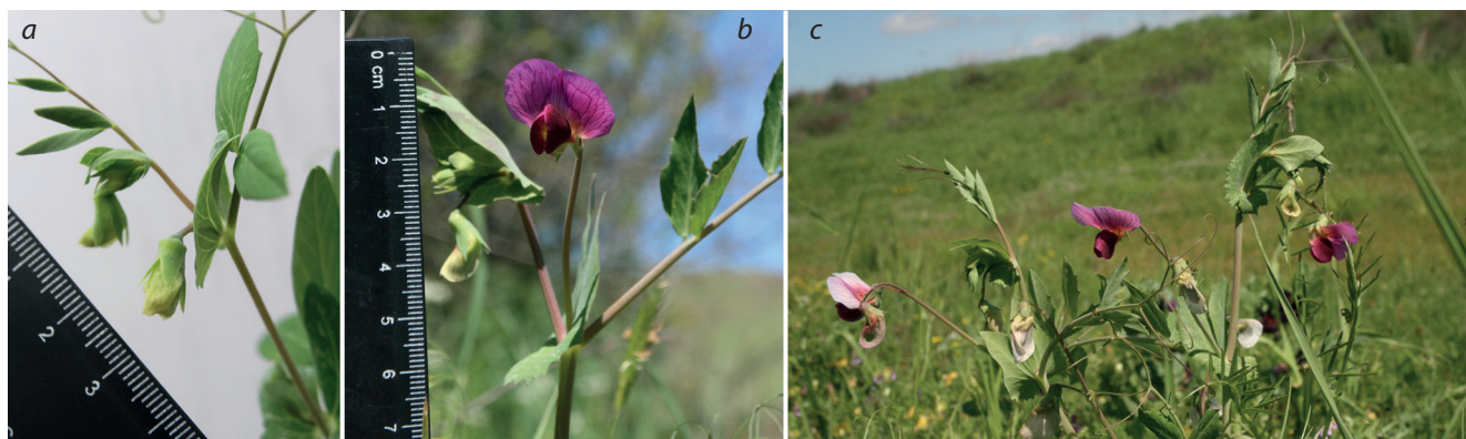
Fig. 8. Flowers of the pea accession JI1794 originating from Tell Abu Nida Hill in Golan Heights in the conditions of the ICG hydroponic greenhouse (a) and in the wild population of Tell Abu Nida, 11.05.2019 (b, c).