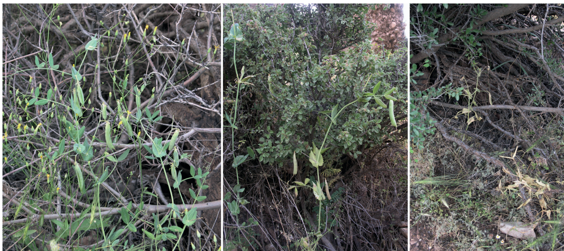
Fig. 2. Plants of P. sativum subsp. elatus of the population at Kagelestan-e Bar Aftab village.