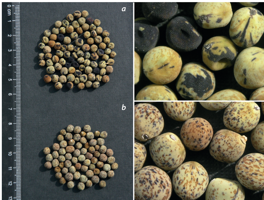
Fig. 5. The seeds of wild pea accessions CE9, originating from a population at Kagelestan-e Bar Aftab village (a), and CE10, originating from a population 6.7 km NW of Istgah-e Bisheh village (b).

to weevil oviposition (Berdnikov et al., 1992). In total 87 seeds were collected, of them 24 appeared infested by the pea weevil. One of those seeds gave rise to accession CE10 (= W6 56890 in the USDA GRIN).