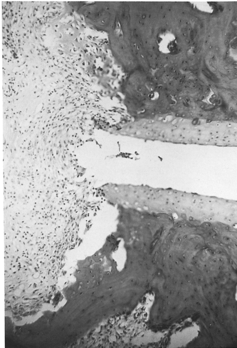
FIG. 2. Section of ankle joint taken approximately 2 wk after onset of type II collagen-induced arthritis. Synovial proliferation and intense infiltration by mononuclear cells is producing cartilage and bone erosion. Hematoxylin and eosin \times 200 .

and sections of the trachea showed no evidence of generalized cartilage inflammation. Likewise, histologic examinations of the skin, lung, and kidney were normal.