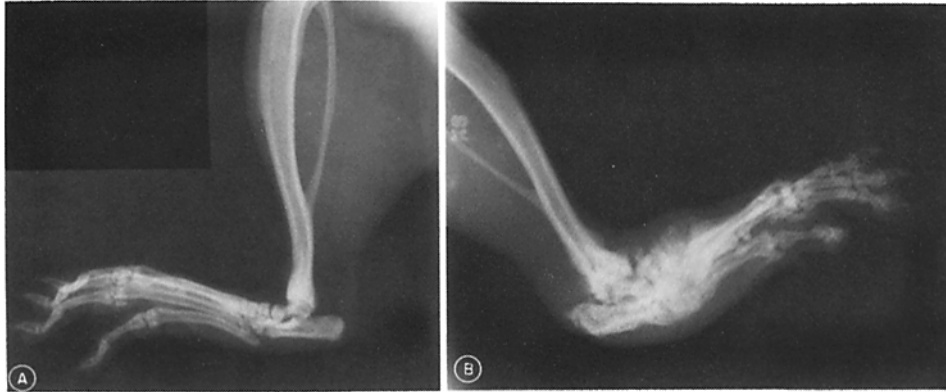
FIG. 3. Comparison of roentgenograph of normal rat hindpaw (A) with that (B) from a rat whose arthritis was induced by chick type II collagen in ICFA. Soft-tissue swelling, bone destruction and periosteal new bone formation are prominent 2 wk after the onset of inflammation.

Additional Attempts to Induce Arthritis. Primary and booster injection regimens employing 2.0 mg per rat of chick type I collagen, human type III collagen, or chick \alpha 1(\text{II}) chains in CFA failed to induce arthritis in a total of 50 additional rats. Also human type I tropocollagen which had been passed through DEAE in a manner identical to the preparative technique for type II collagen did not cause arthritis in 20 rats. No significant differences in the incidence of arthritis were found with doses of type II collagen ranging from 0.5 to 2.0 mg per rat.