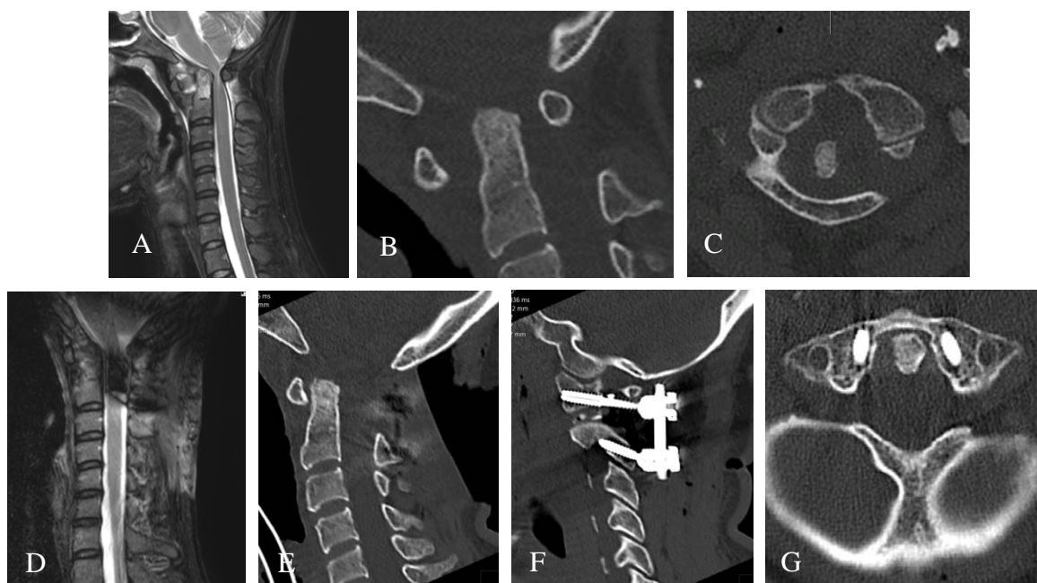
Figure 3. (A) Preoperative MRI imaging of the cervical spine atlantodental instability with retrodental pannus formation and basilar impression due to dorsal displacement of the dens resulting in absolute spinal constriction and myelopathy. (B,C) Enlarged anterior atlantodental interval in the preoperative scan (AADI). (D–G) Postoperative imaging after initially closed and then open reduction and fixation C1-2.

The nerve root C2 was exposed and rhizotomized on both sides, the facet joint between C1/2 distracted and autologous bone chips inserted. After three months, residual sensory deficit of the fingertips on both sides remained, a motor deficit, urinary retention and ataxia were no longer present. There was no relevant pain symptomatology. After 12 months, she had made a complete recovery, and scored 17 on the mJOA scale—see Figure 3.