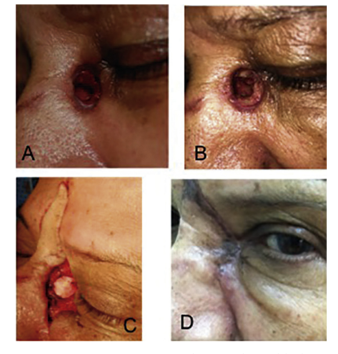
Fig. 2. A. Day 7 post-intravenous antibiotics and post-debridement, shows a palid-colored nasal mucosa and necrotic margins of the wound. B. Day 10 post hyperbaric oxygen shows the wound margins recovering the red color. C. Reconstructive surgery was performed using round ear cartilage graft to occlude the previous bone surgical ostium, associated with a skin muscle malar advancement and a V-Y forehead flap. D. Three months post-surgical repair, the wound was closed and healed.

The culture was positive for Serratia marcescens sensitive to amikacin, ciprofloxacin, meropenem, trimethoprim/sulfametoxazole and Corynebacterium sensitive to erythromycin. The patient was prescribed Clindamycin Hydrochloride (Clindamycin capsules, Pfizer Inc., Greenstone LLC, US) 300 mg every 6 h to reduce chances of a secondary anaerobic infection and Ciprofloxacin hydrochloride tablets (Cipro, Bayer HealthCare Pharmaceuticals Inc., Wayne, NJ, US) 500 mg twice daily. Daily dressing was performed and