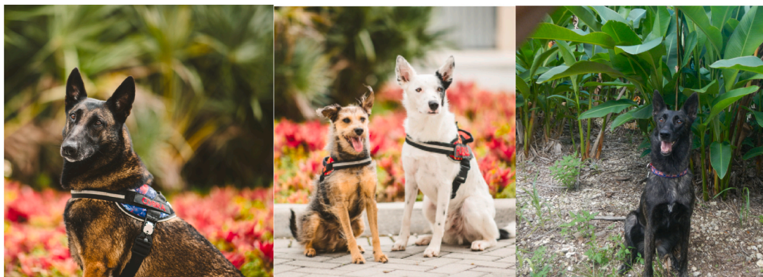
Fig. 1. The four canines used in this study Cobra (Left), Mac (Center left), Hubble (Center right) and One Betta (Right).

Headspace SPME-GCMS of a mix of volatiles analyzed pre and post UV-C radiation was a critical step to evaluate whether the method of sample preparation and making training aids safe for both handlers and canines was viable. A Student's T-Test showed there was no significant difference in odor concentration pre and post UV-C (Fig. 3.)