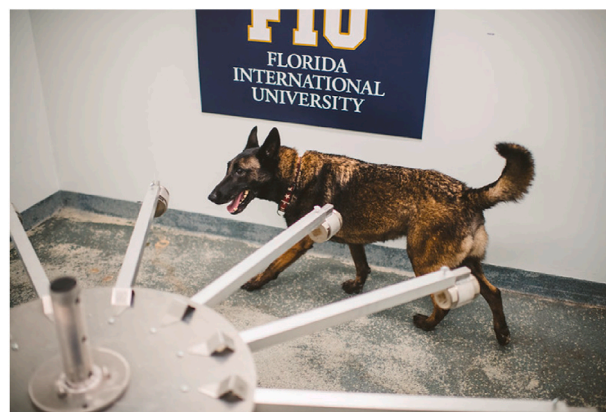
Fig. 2. Canine Cobra using the training wheel.

This began the process of odor imprinting to allow the canines to detect the familiar scent of the UDC calibrant while also introducing the scent of COVID-19. This training took place for approximately 1 month with training three times per week. The next phase of training involved the removal of the UDC from the scent picture and allowing the canines to search the scent wheel. Positive alerts, indicated by the canine sitting or lying down, were recorded as well as false positives and false negative alerts. In all 156 training runs were completed, and the accuracy and